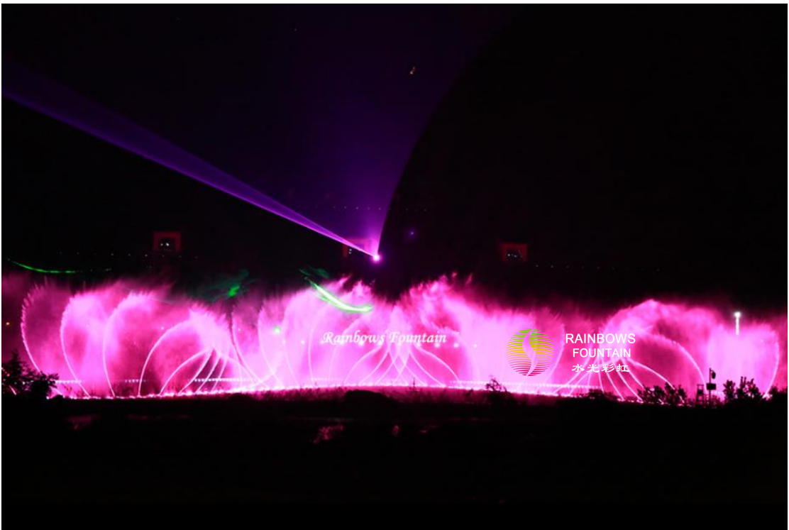
Fountain Design proposal and site situation