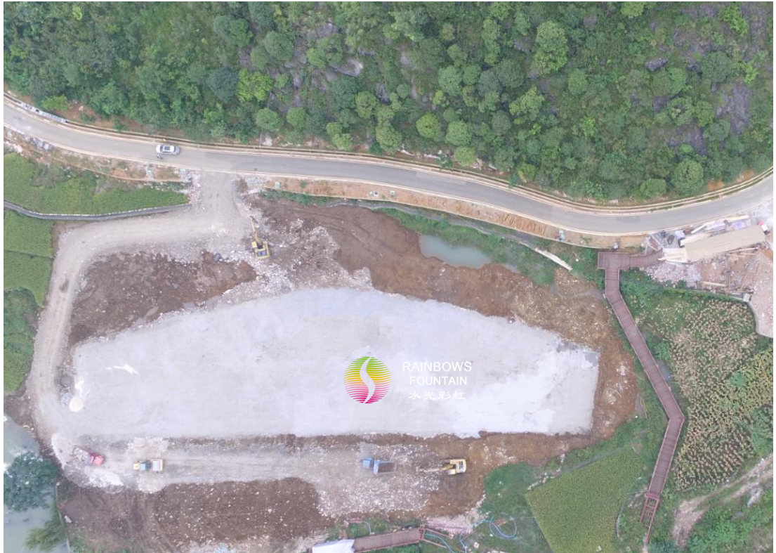
On site Installation and Commissioning